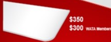
.063" Aluminum - Permanent