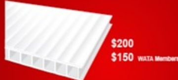
.40" Coroplast - Temporary Fluted Plastic