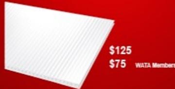
.16" Coroplast - Temporary Fluted Plastic *(Mount on Solid Surface Only)

Aluminum & .40" Coroplast signs have pre-drilled holes and come with instructions for mounting to (2) - 4"x4" posts or directly to a solid surface.